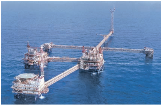
The same is true for offshore platforms: the quality of the surface technology applied plays an essential role in their safety and lifespan