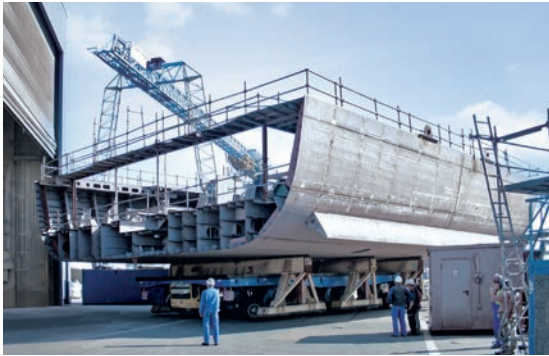
Frigates, yachts or cruise ships: with our state-of-the-art equipment and extremely high quality standards, we ensure solutions for the ship-building sector are executed professionally