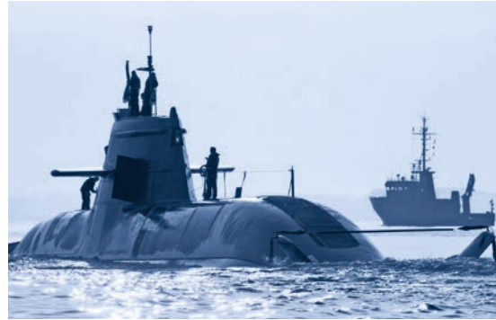
Particularly sophisticated coatings are needed to protect submarines against corrosion. Our specially trained personnel also have specific project experience in this special area, too