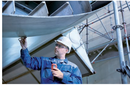
Our comprehensive quality assurance activities include measuring layer thickness and drawing up inspection records for TÜV