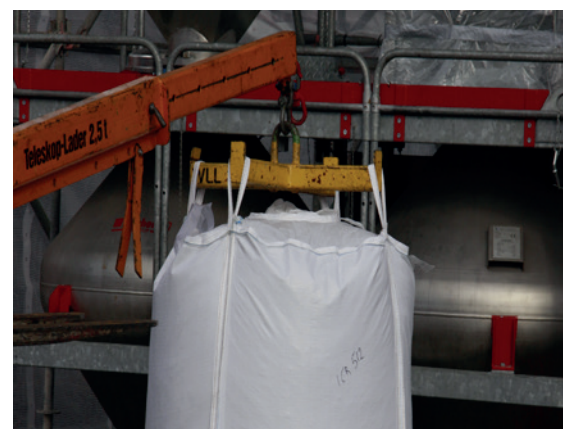
The material is transported from the big bag to the preloading container at the ground level with a forklift truck