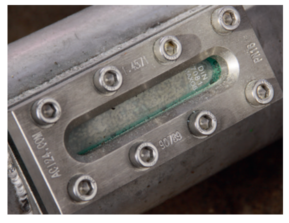
Continuous monitoring of the material flow from the Dense Phase Conveyor upwards to the specially designed filling hopper